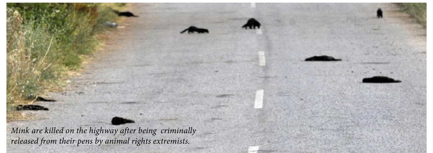
Mink are killed on the highway after being criminally released from their pens by animal rights extremists.